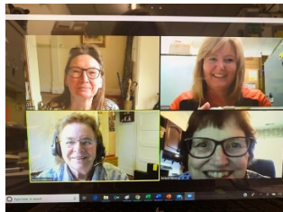
Our UFDC EC in recent Zoom meeting