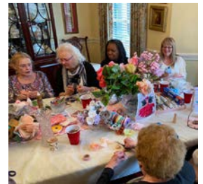
Queen Anne's Revenge Doll Club Craft Project