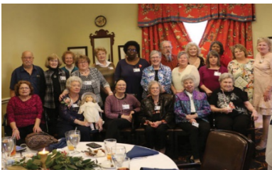
Rowan Doll Society Anniversary Meeting Salisbury, NC