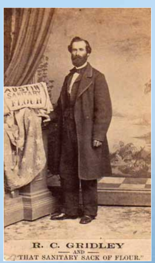
Reuel Gridley and his 50 pound sack of flour. (Vintage postcard)